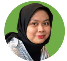
Anugerah Putri Indonesia